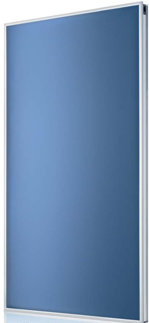
SOL 27 Premium S (standard)