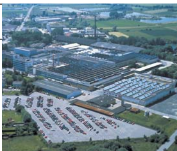
Stiebel Eltron's plant in Holzminden, Germany.

Stiebel Eltron has been a world leader in the development of advanced water heating technology for over 80 years. Our pursuit of engineering excellence and high-quality manufacturing results in products fulfilling the highest expectations of performance and reliability. They are... Simply the Best.